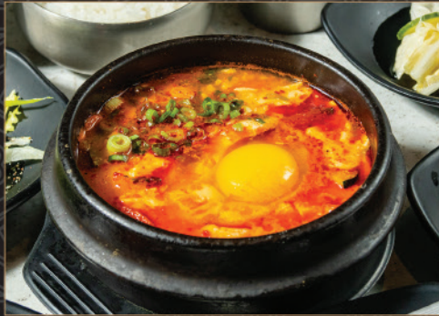
27. Haemul Soondubu Jjigae