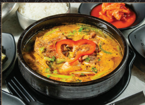
31. Ttugbaegi Gamjatang