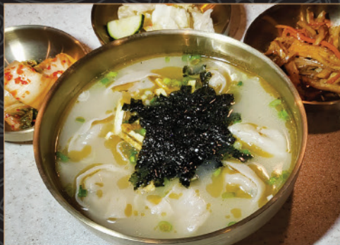
30. Dduck Mandu Gook