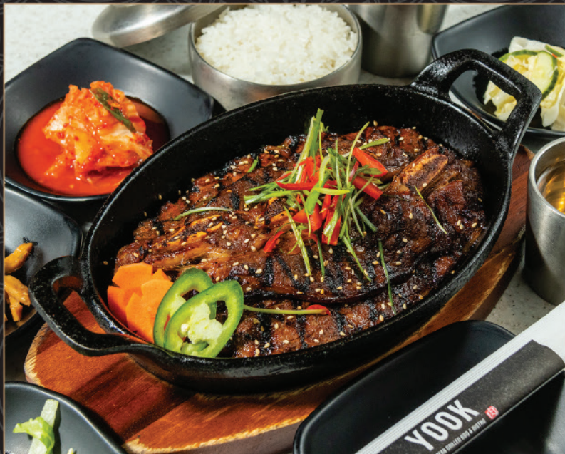
22. LA Galbi