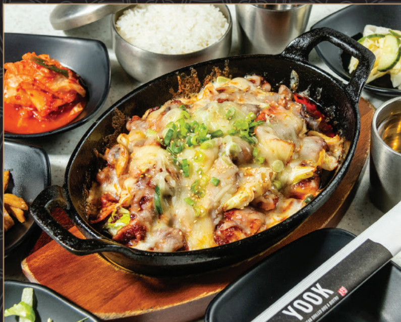
15. Spicy Dakgalbi (Chicken) + Add Mozzarella Cheese

Served on a cast iron dish / All off the grill dishes comes with a bowl of rice & salad