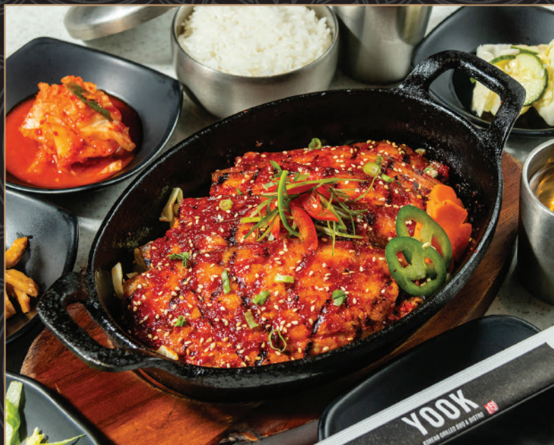
16. Gochujang Samgyupsal